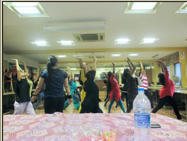
Martial Arts Training for girls in our college