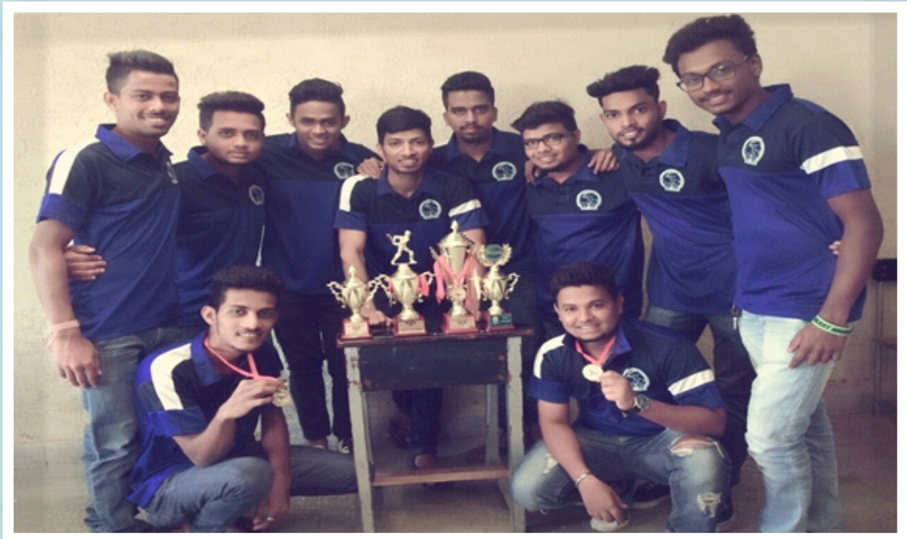
(Winning Team of Inter-Collegiate Box Cricket)

competitions. Individuals and the teams our college won various prizes in this year. The details of our winning is as per follows.