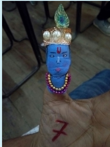
Our Award winning arts in 'Maharashtra utsav'