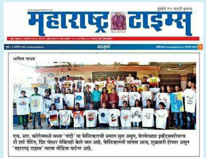
Some of our students in NANDI festival