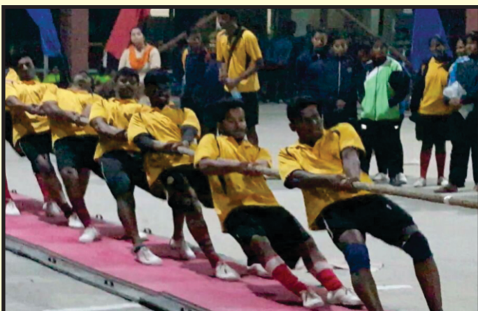
Our Award winning Tug of war Team