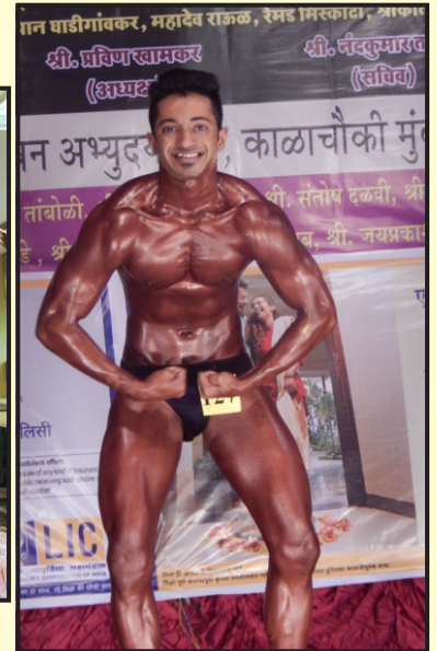
Winner of Body Building Competition