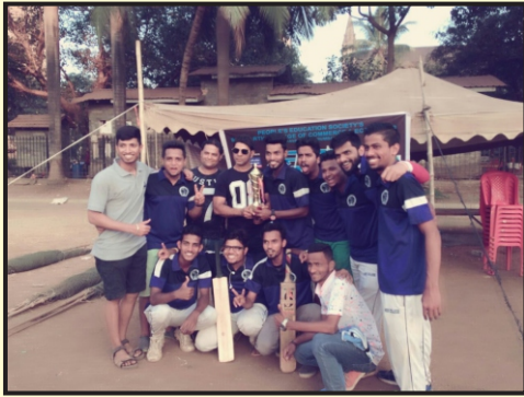
Intercollegiate Award winning Box Cricket Team