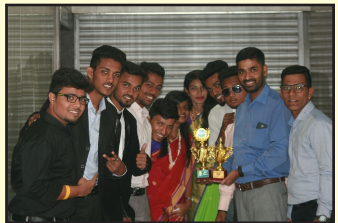
Our Intercollegiate Sports Competitions winners