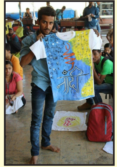
Our student at Nandi Festival