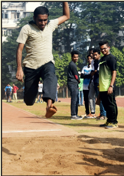
Annual Sports Day at University Sports ground.